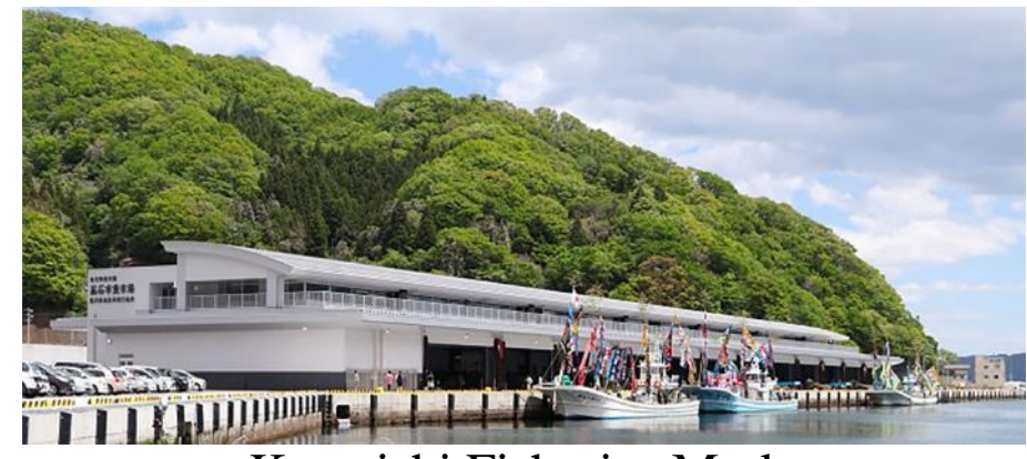
Kamaishi Fisheries Market

Sanriku Fisheries Research Center, Iwate University