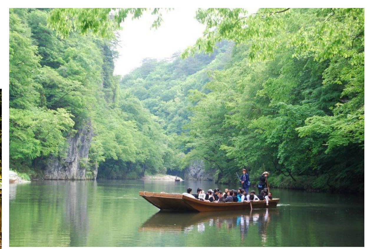
Geibikei Gorge River